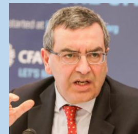
Carmine Di Noia, Commissione Nazionale per le Società e la Borsa (CONSOB Italy), Commissioner

Carmine Di Noia is Commissioner at the Italian Securities and Exchange Commission (CONSOB), since 2016.